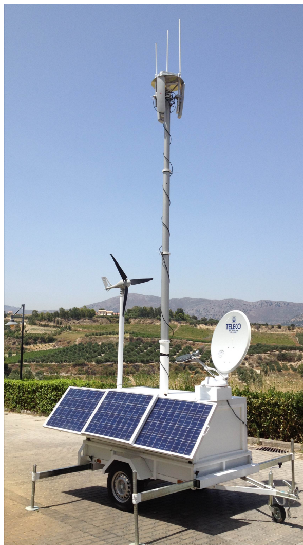
Fig. 1. Actual picture of the first REDComm node prototype with the pneumatic mast partially extended.

The physical layer of IEEE 802.11a has been implemented entirely in software on the open source GNU Radio platform [8], and by proper custom modifications it is presented as a normal wireless interface to the Linux operating system. Therefore, there are three SDR-based 802.11a interfaces, which are used as the Backbone Network Infrastructure (BNI) for the REDComm node.